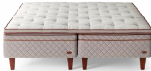
DUX classic frame bed with natural latex top pad.

Many DUX customers have had their bed forever, long after our warranty or normal usage, without care. We believe the ability to change parts, renew or restore our products, helps that long-lasting effect, unlike any other product. We guide the customer on caring for their bed so that even after the 20-year warranty is over, no problems.