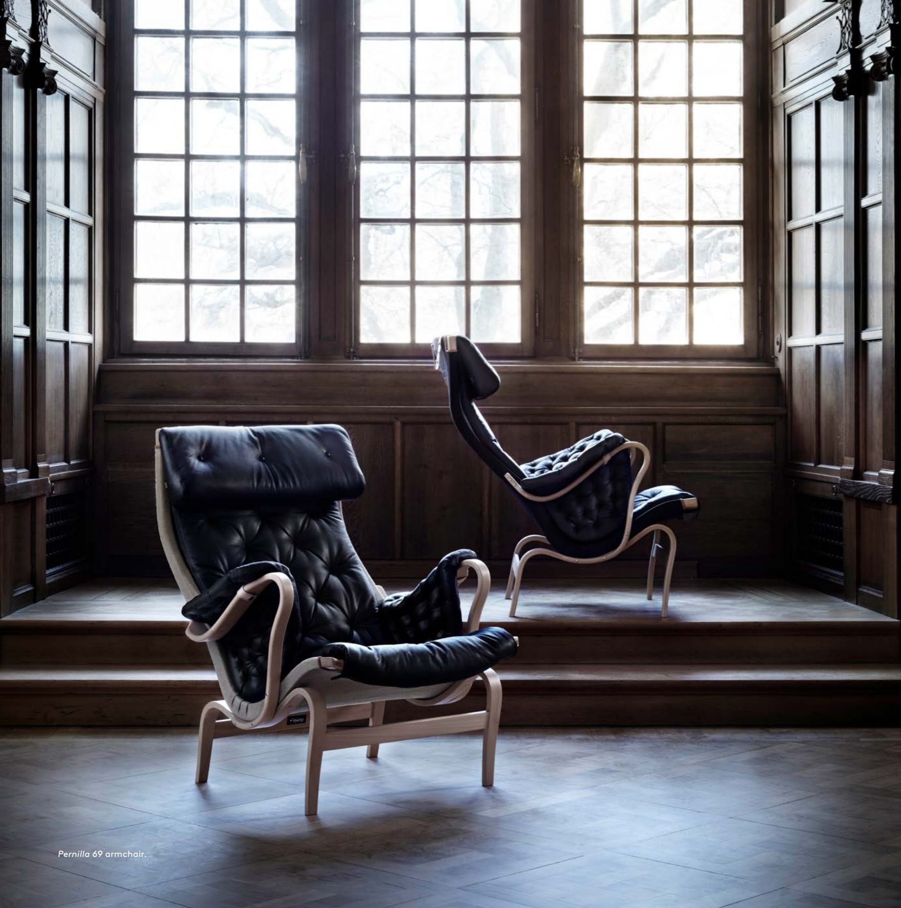
Pernilla 69 armchair.