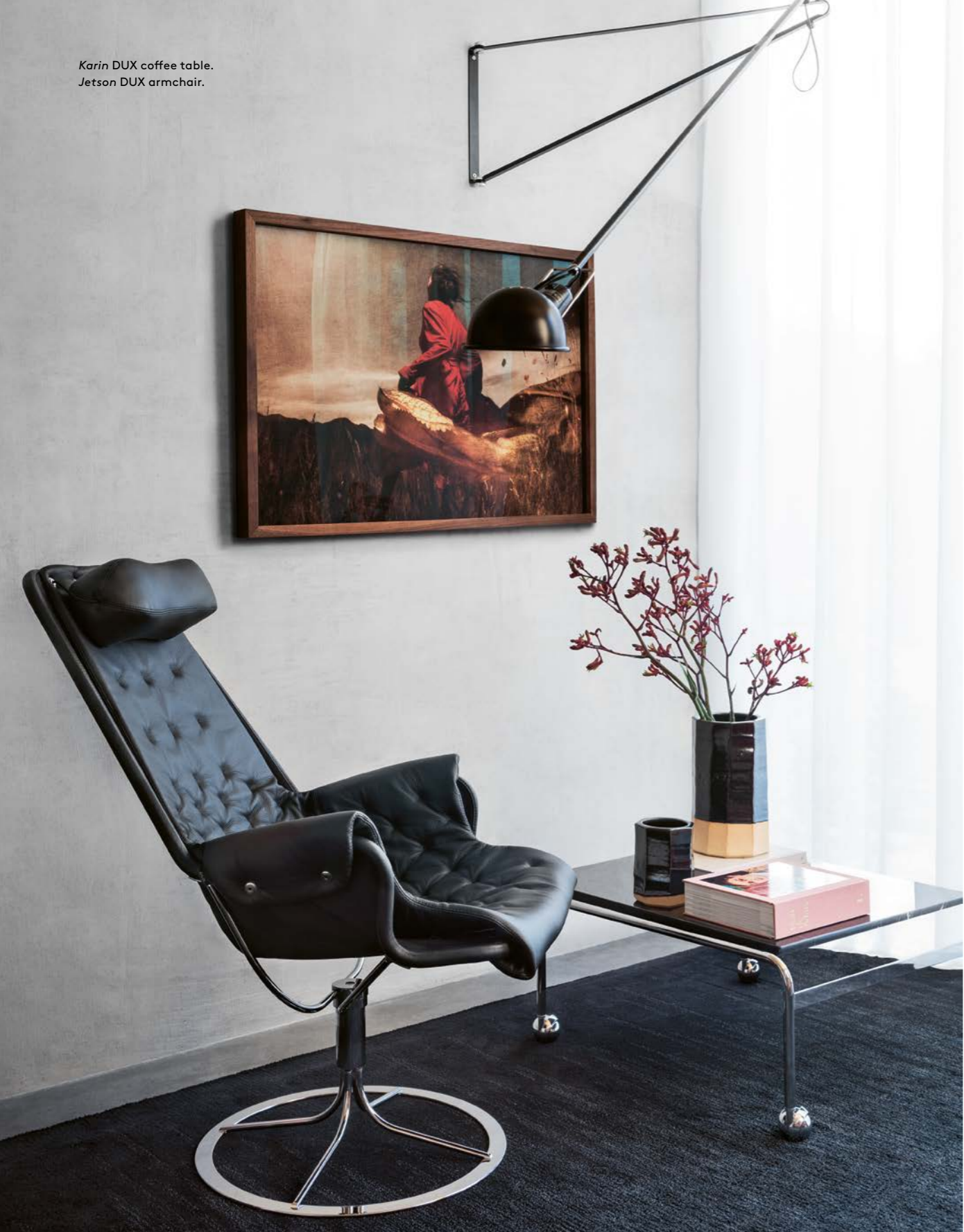
Karin DUX coffee table. Jetson DUX armchair.

Thank you Galleri Christian Larsen for the loan of Cooper & Gorfer pictures.