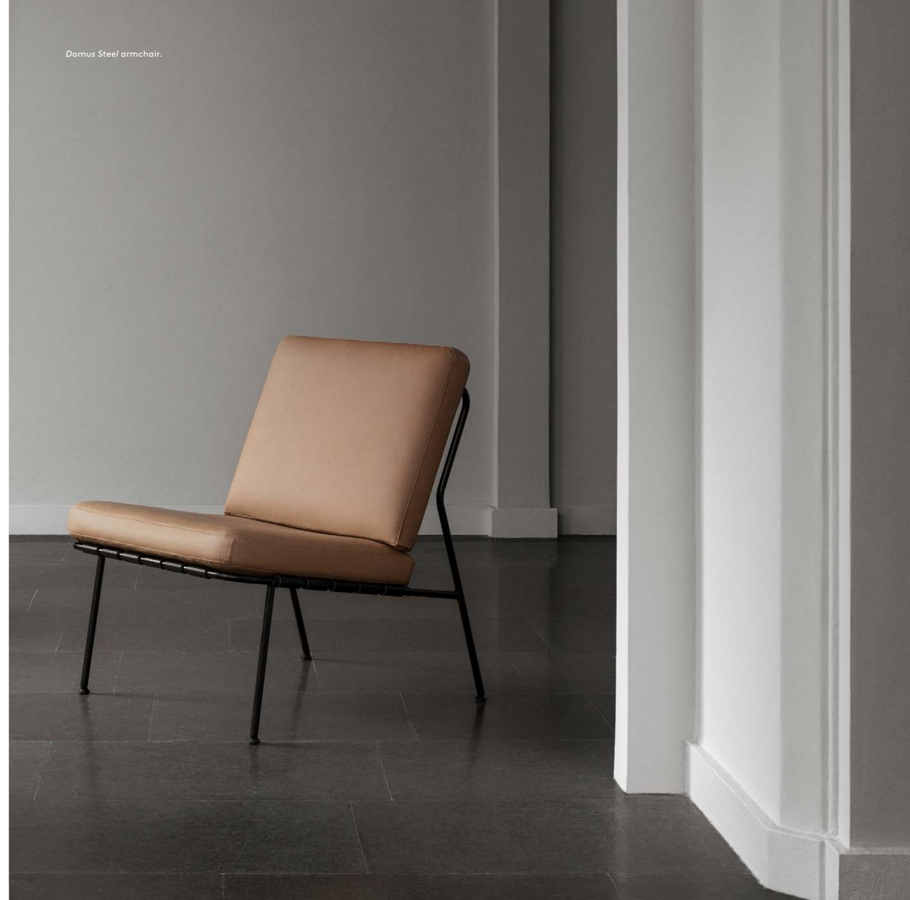
Domus Steel armchair.