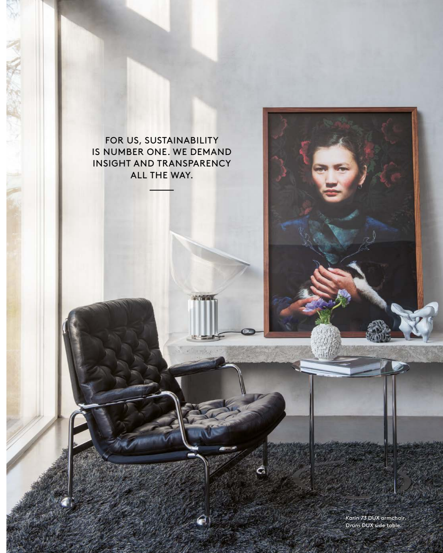
Karin 73 DUX armchair. Drum DUX side table.

FOR US, SUSTAINABILITY IS NUMBER ONE. WE DEMAND INSIGHT AND TRANSPARENCY ALL THE WAY.