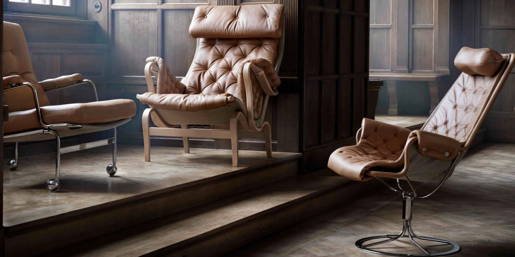
Karin, Pernilla 69 and Jetson armchairs.