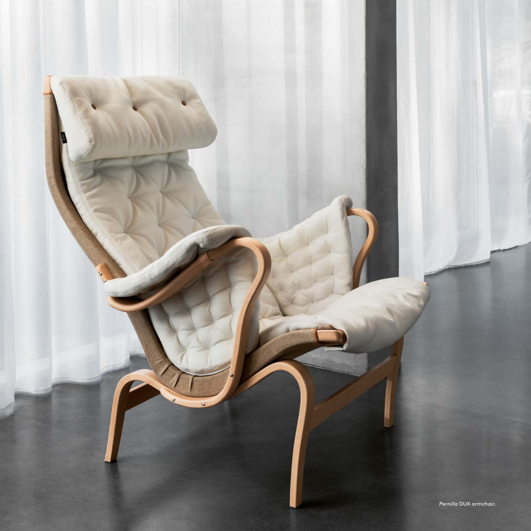
Pernilla DUX armchair.