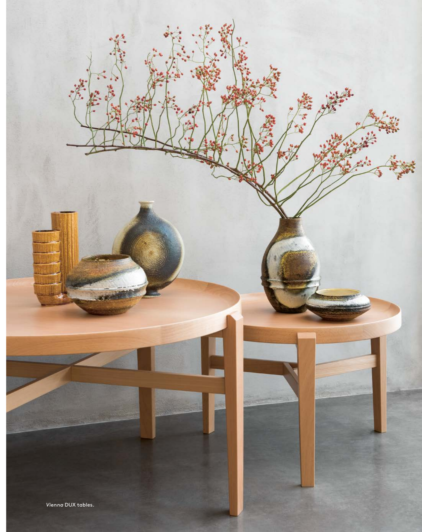
Vienna DUX tables.