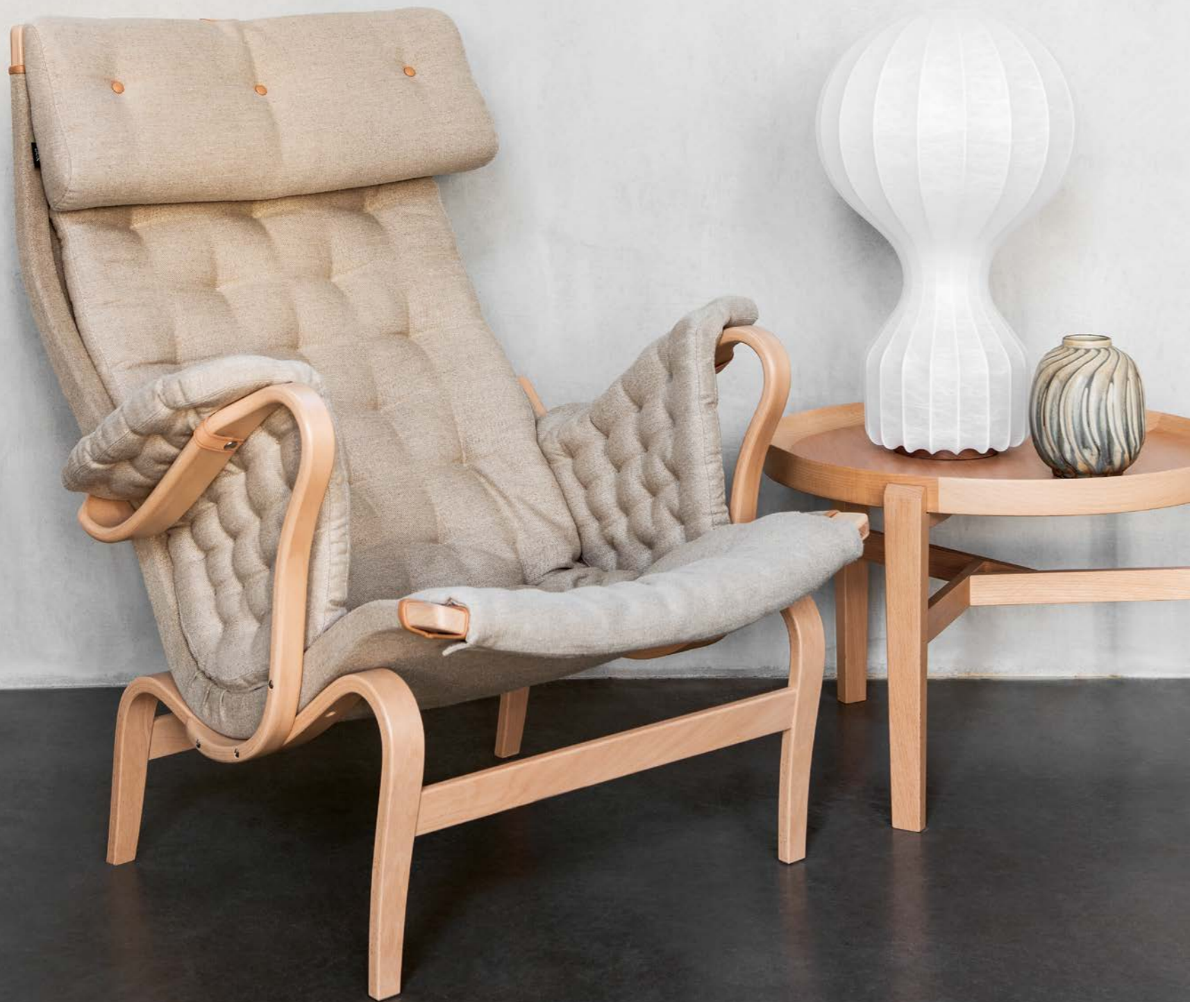
Pernilla DUX armchair. Vienna DUX tables.

FOR US, SUSTAINABILITY IS NUMBER ONE. WE DEMAND INSIGHT AND TRANSPARENCY ALL THE WAY.