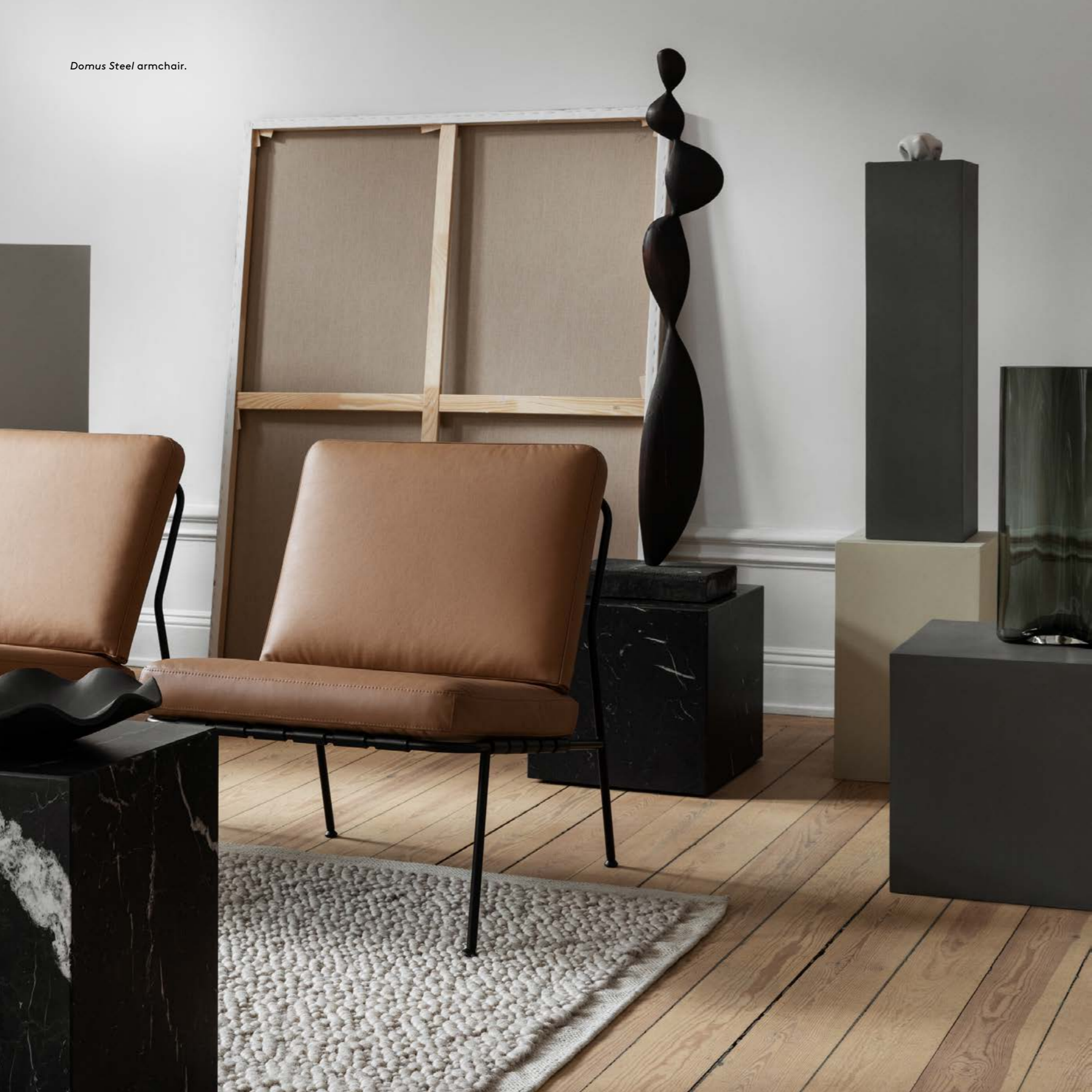
Domus Steel armchair.