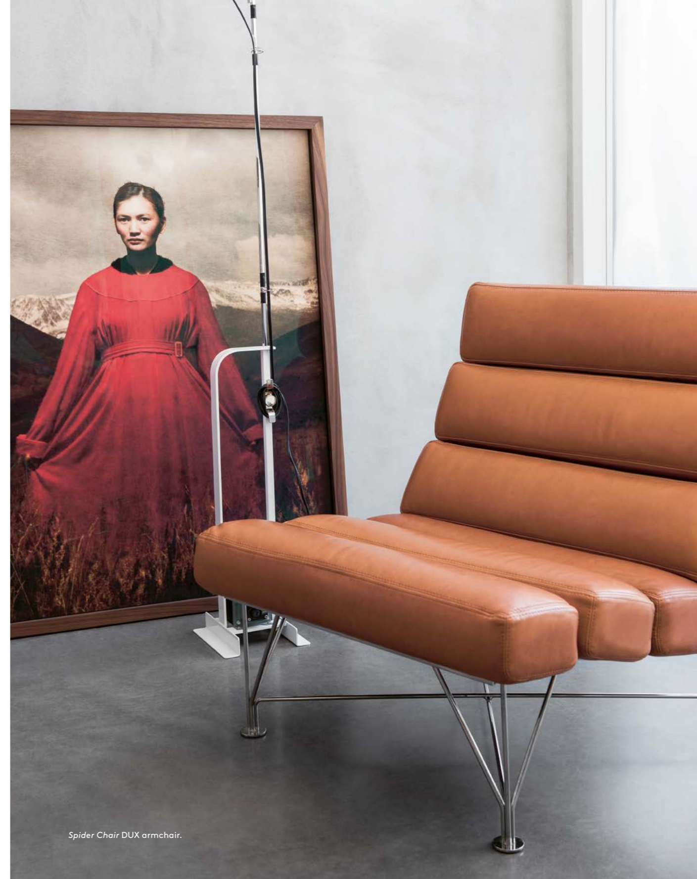
Spider Chair DUX armchair.